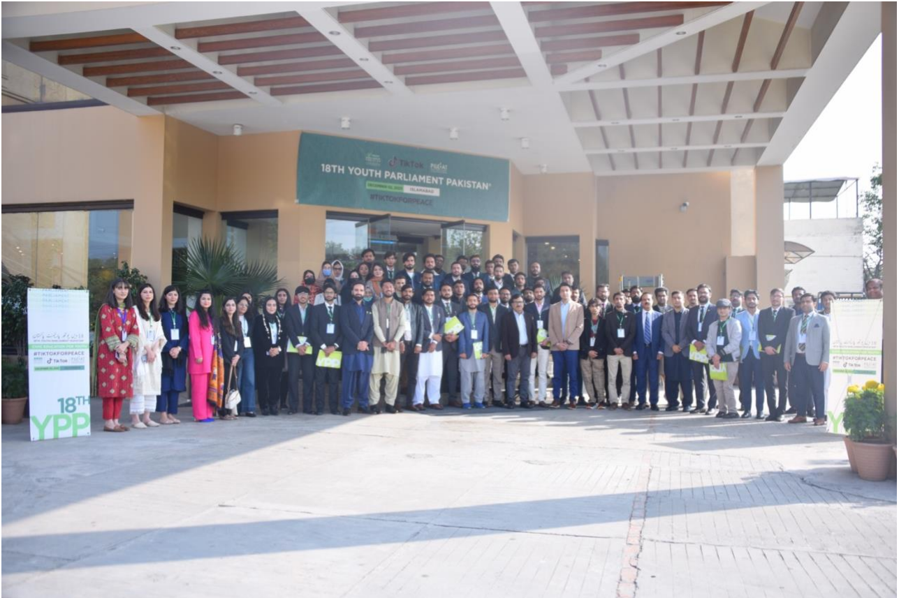
Group photo of members of 18th Youth Parliament Pakistan® at the first session

The session continued with a group photo capturing the diverse assembly of young minds committed to civic engagement. A networking lunch provided an informal setting for members to exchange ideas and build connections.