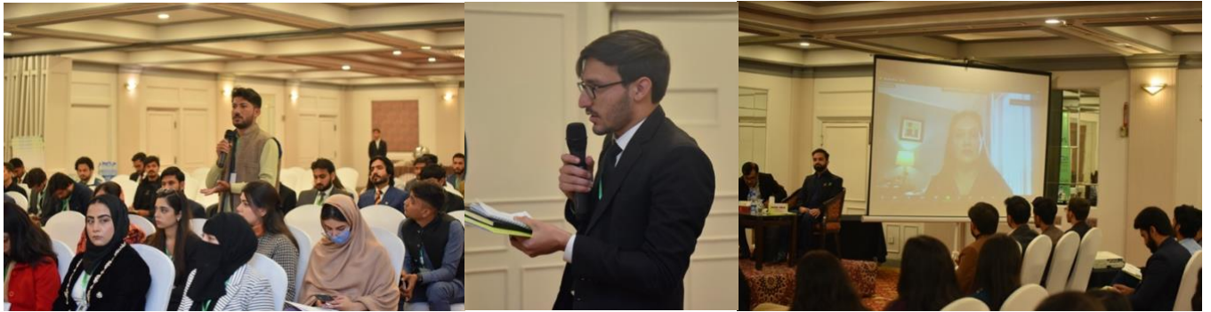
Engaging in an Interactive Panel Discussion on Countering Online Hate Speech: Addressing Questions Raised by MYPs