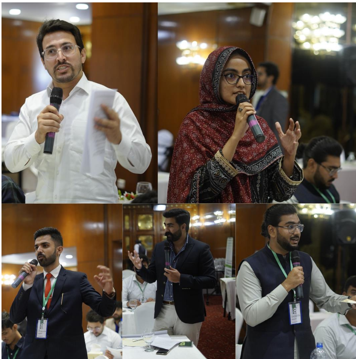
MYPs debating on the National Civic Education Commission Act, 2018 at the fourth session of the 18th Youth Parliament Pakistan® on May 11, 2024, at Karachi