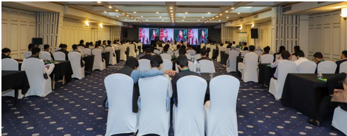
Screening podcast series titled Reimagining Local Government in Pakistan at the final session of 18 th YPP in Islamabad

The 7th and final session of the 18th Youth Parliament Pakistan® YPP began on a reflective yet energetic note at the Margalla Hotel, Islamabad, on May 02, 2025. Marking the culmination of an intellectually enriching journey, the session opened with a to engage youth in the discourse on grassroots governance through the screening of the first episode of PILDAT's new podcast series titled Reimagining Local Government in Pakistan . The podcast, designed as a civic education tool, explored the structural and functional disconnects within Pakistan's local government systems, aiming to ignite critical thinking and reform-oriented dialogue among the youth. For many MYPs, this was not just content it was context; it brought home the question of why local governments, as the closest form of government to citizens, remain one of the most neglected tiers of governance in the country.