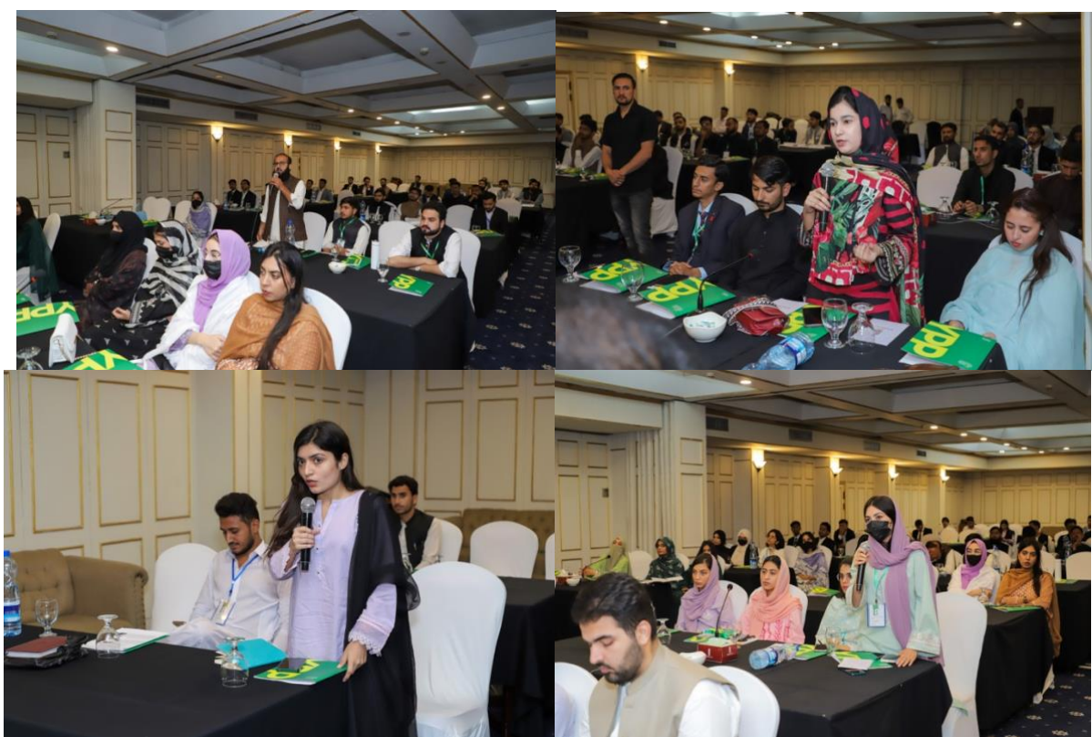
MYPs debating at the challenges & flaws in the local government system in Pakistan at the final session of 18 th YPP in Islamabad

As the debate unfolded, what became apparent was the collective frustration with systemic inertia, but also a deep-rooted belief in democratic solutions. The discussion reflected the intellectual maturity and civic awareness of the MYPs, who repeatedly stressed that youth inclusion in governance must begin at the local level. Several participants called for immediate legal and constitutional clarity on the mandates and timelines for holding local elections, urging provincial governments to uphold their responsibility in strengthening democratic structures. Others highlighted that awareness and advocacy are crucial; citizens must understand the importance of local governments, not as bureaucratic shells, but as engines for localized service delivery, conflict resolution, and community development. Through this exchange, the MYPs reaffirmed their commitment to building an informed, accountable, and participatory democratic culture in Pakistan; one that begins with empowered local governance.