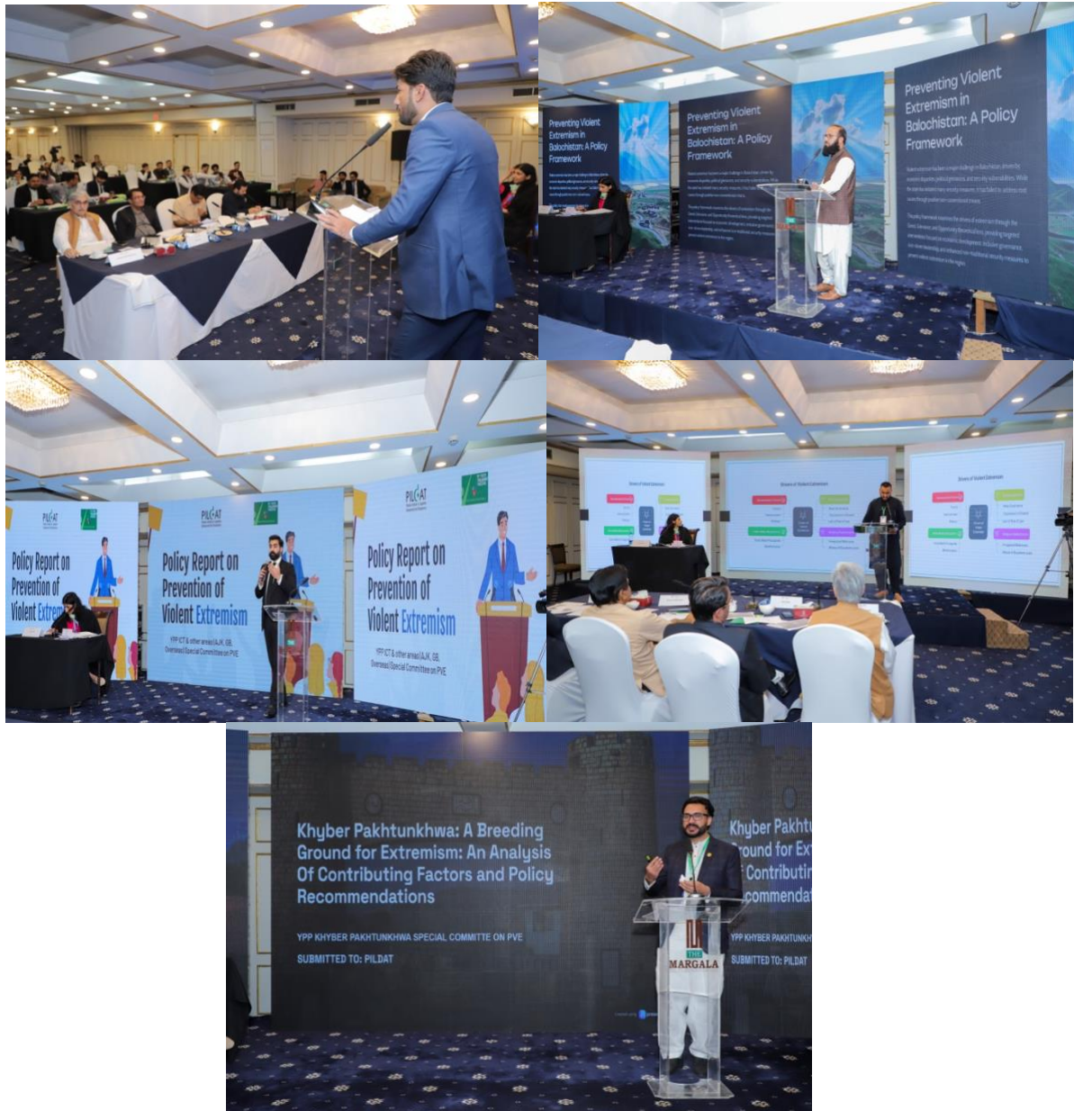
Chairpersons of the five special Committee on PVE; giving presentations to the distinguished panel of Judges at the 7th session of 18th YPP

After thorough deliberation, the Special Committee on Khyber Pakhtunkhwa was adjudged the best-performing committee. The judges commended their presentation for being exceptionally well-researched, analytically robust, and grounded in both academic insight and grassroots realities. Their recommendations not only addressed systemic drivers such as governance gaps and lack of youth engagement but also proposed actionable interventions in education, community-based dialogue, and institutional reforms.