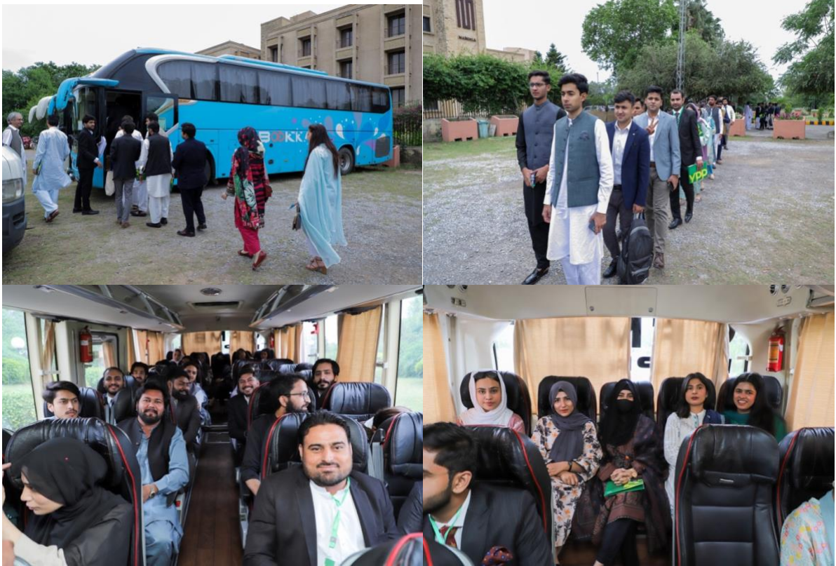
Members of the 18 th YPP going for a study to the Parliament House of Pakistan as part of the final session of 18 th YPP in Islamabad

Following the insightful discourse on local governments, members of the 18th Youth Parliament Pakistan® proceeded on a structured institutional visit to the Parliament of Pakistan, with a dedicated focus on the Senate the Upper House of the national legislature. This segment of the session was designed not only as a ceremonial excursion but as an immersive learning experience that connected the theoretical understanding of parliamentary democracy with its lived, institutional manifestation. At the Senate Museum, MYPs embarked on a visual and historical journey through the evolution of the Senate tracing its establishment post-1973 Constitution, the reasons for its creation, and its critical role in ensuring federal balance by providing equal representation to provinces regardless of population size.