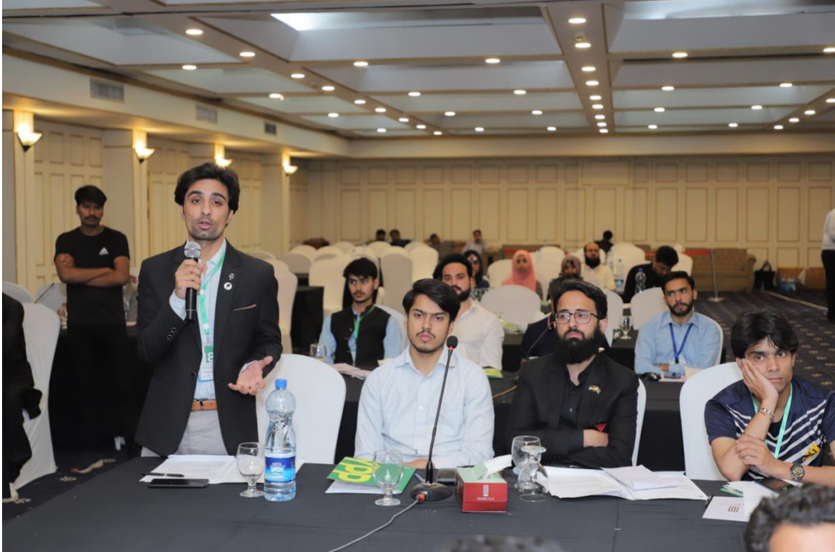
MYPs debating on “How Can Climate Change Policies Address Violent Extremism?” at the final session of 18 th YPP

Her remarks were followed by a compelling set of questions from the Members of Youth Parliament - MYPs, who demonstrated deep awareness and critical thinking on these complex issues. The discussion touched on the potential of technologies like Starlink to support connectivity and relief operations in disaster-prone or underserved regions, the need for coherent and accessible solar energy policies, and the impact of heavy taxation on renewable energy adoption. MYPs also raised questions about Pakistan’s ability to secure fair compensation and support through international climate finance mechanisms for loss and damage, and expressed concern over the practical consequences of the suspension of the Indus Waters Treaty, particularly for canal systems and water-stressed areas. The dialogue served as a timely reminder of how environmental challenges intersect with issues of technology, governance, equity, and