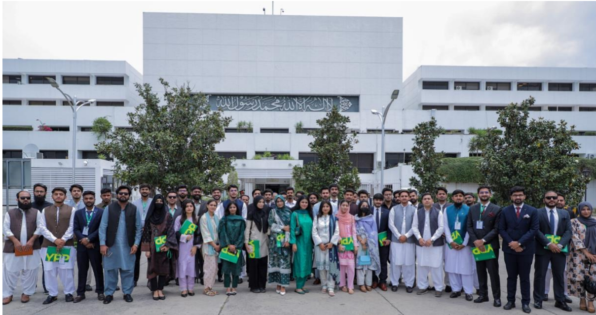
Group Photo of Members of the 18 th YPP at the Parliament House of Pakistan in Islamabad

The exhibits, documents, and archival material housed in the Museum provided compelling insights into the Senate's contributions to legislation, federal harmony, and democratic continuity. For the MYPs, the experience fostered a deeper appreciation for the Senate's unique position in safeguarding provincial interests and offering legislative oversight through its specialized committees and bicameral checks. The visit was especially relevant to the YPP's broader objective of cultivating future leaders who understand not just political rhetoric, but the architecture and mechanics of governance. As young representatives walked through the chambers and corridors where the country's most consequential deliberations occur, they were able to situate their own simulated parliamentary roles within the context of real-world legislative processes. This bridging of classroom knowledge and constitutional practice underscored the importance of institutional memory, democratic rituals, and the role of youth in protecting and participating in Pakistan's evolving parliamentary landscape.