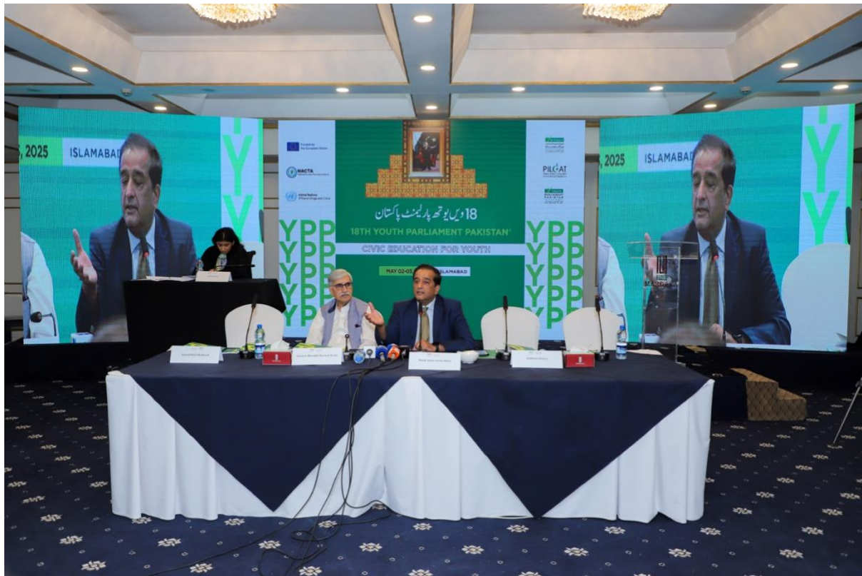
Malik Amin Aslam Khan, former Federal Minister for Climate Change talking about the adverse effects of climate change and how they lead to extremism at the policy dialogue; at the 7th session of 18th YPP

of dollars in economic losses a toll that reflects both human suffering and systemic fragility.