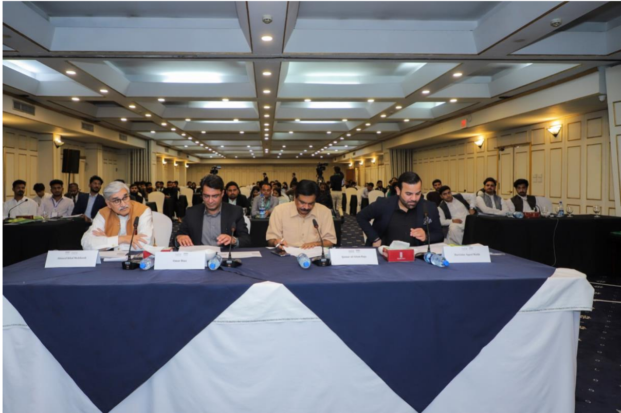
Distinguished panel of Judges at the 7th session of 18th YPP; to judge the presentations by the Youth Parliament Pakistan Special committees on PVE