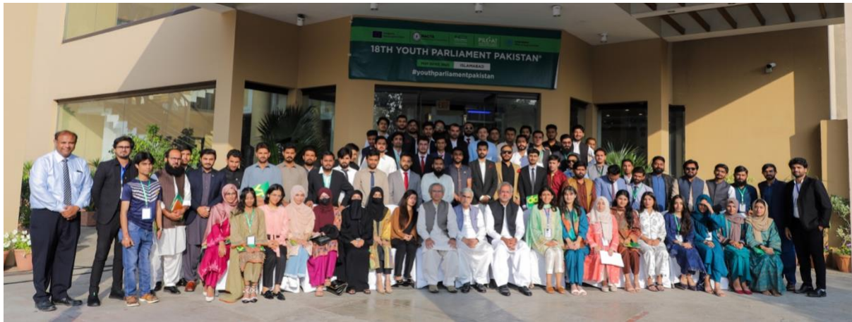
Group photo with Mr. Shahid Khaqan Abbasi, former Prime Minister of Pakistan, at the final session of 18th Youth Parliament Pakistan, at Margalla hotel, Islamabad

Mr. Abbasi asserted, “The Constitution must be upheld by all stakeholders if there is to be rule of law in the country.” He emphasized that only rule-based systems can solve the crisis of youth disillusionment. The session sparked an engaging Q&A with Members of Youth Parliament -MYPs, who questioned whether the Constitution is flawed itself, how political parties can tangibly empower youth, and whether electoral reforms are needed to rebuild trust. Mr. Abbasi responded with a clear message: democratic norms and strong institutions are key to countering radicalization and reclaiming hope. Mr. Abbasi emphasized that governments must create opportunities for youth, only then will we see an end to disillusionment. The session sparked an engaging Q&A with Members of Youth Parliament - MYPs, who questioned whether the Constitution is flawed itself, how political parties can tangibly empower youth, and whether electoral reforms are needed to rebuild trust. Mr. Abbasi responded with a clear message: democratic norms and strong institutions are key to countering radicalization and reclaiming hope. Mr. Abbasi emphasized that governments must create opportunities for youth, only then will we see an end to disillusionment.