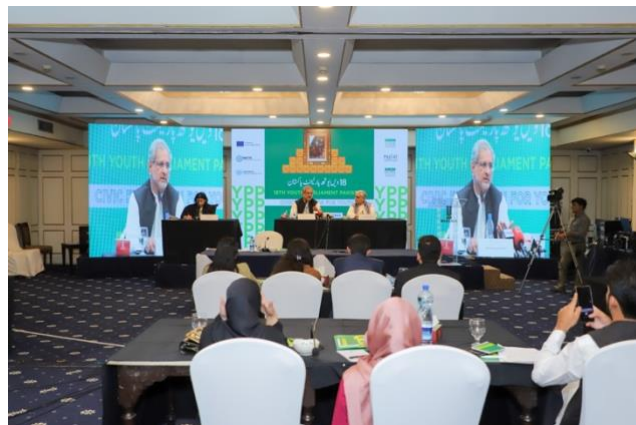
Mr. Shahid Khaqan Abbasi, former Prime Minister of Pakistan, addressing MYPs on the theme “How Can Youth Overcome Political Disillusionment and Find Hope in the Face of Radicalization?” at the 7th session of 18th YPP.

The afternoon featured a high-level conversation with former Prime Minister Shahid Khaqan Abbasi , centered on the question: "How Can Youth Overcome Political Disillusionment and Find Hope in the Face of Radicalization?" , called for deep introspection on the roots of disillusionment among Pakistan’s youth. He stressed the urgency of diagnosing the causes whether systemic failure, lack of opportunity, or broken trust before proposing solutions. With two-thirds of the population under the age of 32, he described Pakistan’s youth as its greatest untapped asset, comparing its potential to that of China’s development model.