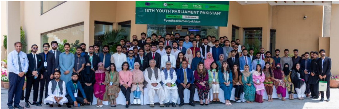
Group photo with the panelists on the second sitting of the final session of 18 th YPP

international diplomacy making it clear that youth voices must be central in shaping climate-resilient futures.