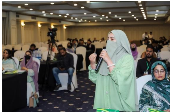
Members debating on the resolution passed at the second sitting of 18 th YPP.

The afternoon featured a high-level conversation with former Prime Minister Shahid Khaqan Abbasi , centered on the question: "How Can Youth Overcome Political Disillusionment and Find Hope in the Face of Radicalization?" , called for deep introspection on the roots of disillusionment among Pakistan’s youth. He stressed the urgency of diagnosing the causes whether systemic failure, lack of opportunity, or broken trust before proposing solutions. With two-thirds of the population under the age of 32, he described Pakistan’s youth as its greatest untapped asset, comparing its potential to that of China’s development model.